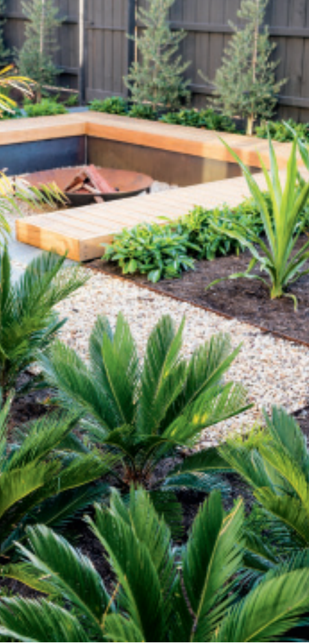
TOP Here, special features range from a built-in deck daybed to built-in seating — cool. bayongardens.com.au ABOVE Use garden edging to keep things neat and inbuilt seating to maximise your space. bayongardens.com.au

or the pots to refresh the look of an outdoor space; and when you move house, you can take your garden with you.