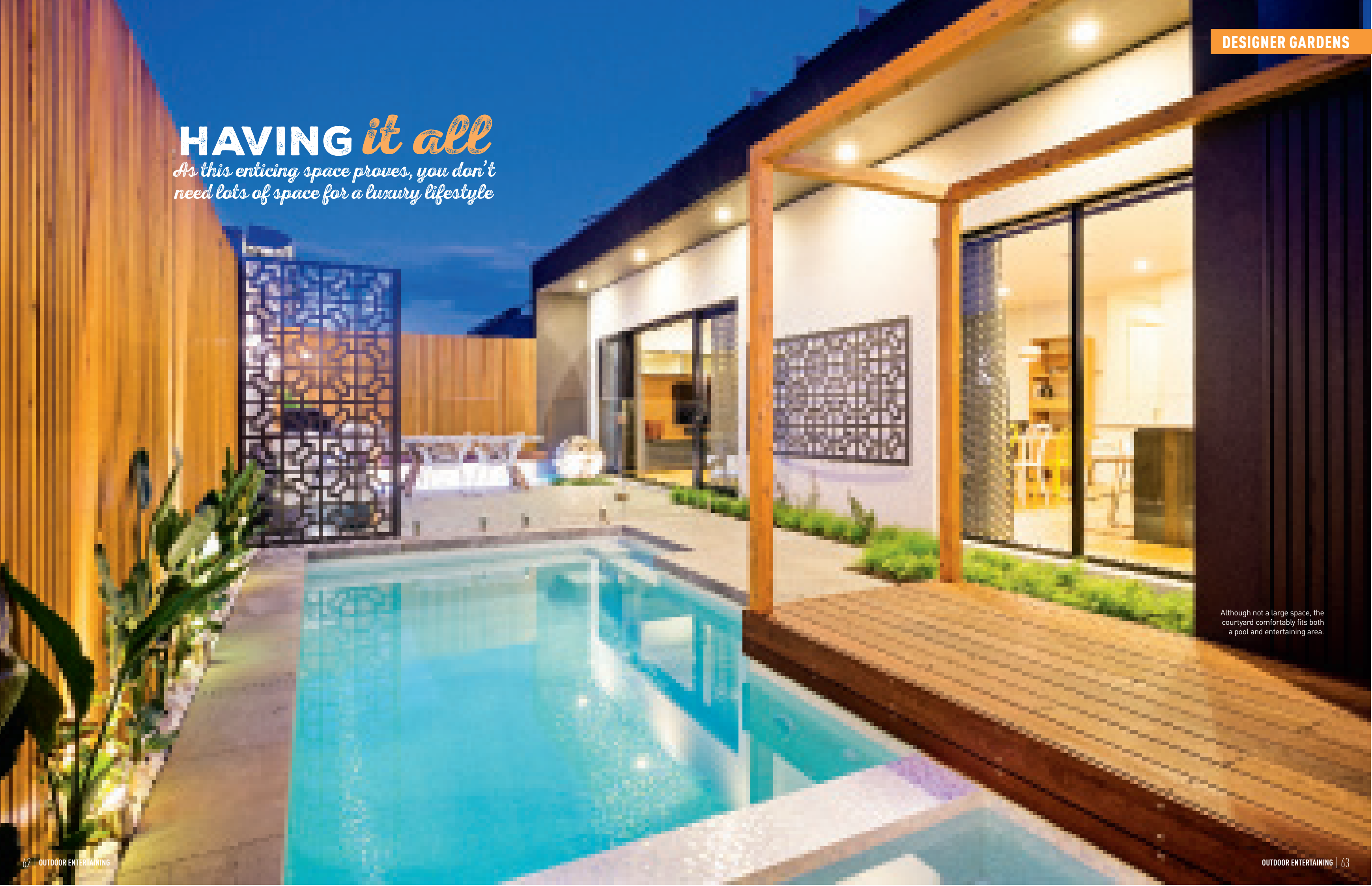
Although not a large space, the courtyard comfortably fits both a pool and entertaining area.

As this enticing space proves, you don't need lots of space for a luxury lifestyle